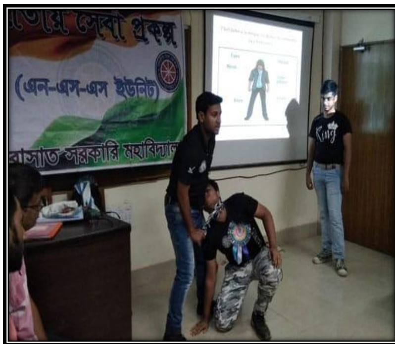
Program on Self Defense of Women (NSS)